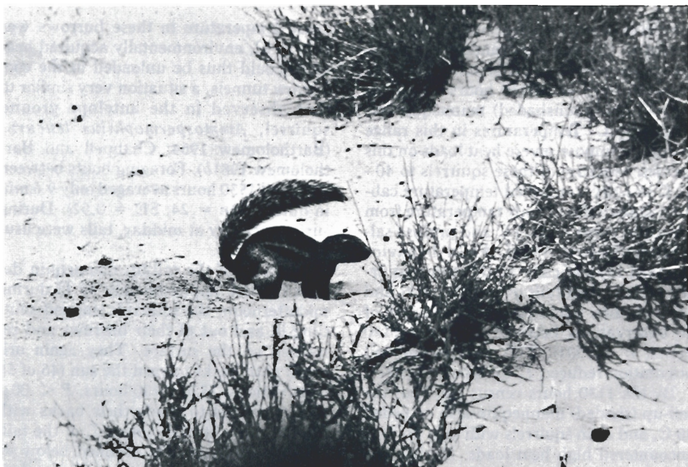
FIG. 1.—Use of the tail as a sun shade by the Cape ground squirrel ( Xerus inauris ). Top , The erected tail covers the entire dorsal surface of a sitting animal. Bottom , The tail is held erect over the back of a horizontal squirrel. Note the shading of the body and head.